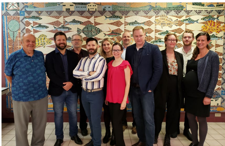
"Victory Square supports the annual Equality Breakfast, a highlight of many of the attendees' yearly calendar (myself most definitely included). Every year we are educated, uplifted and inspired."

Victory Square was established to advance the rights of unions and workers. The firm has a long history of commitment to socially progressive causes, whether in taking on strategic pro bono or low-fee work or supporting organizations that are doing work to improve the lives of workers and historically disadvantaged people. This commitment also manifests in our everyday work, whether that be brainstorming innovative ways to argue sexual harassment cases or talking to our client unions about ensuring their collective agreements and bathroom signage is inclusive of all genders. I see much overlap between Victory Square's work and the mission and values of West Coast LEAF.