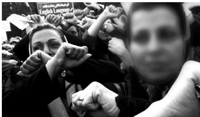
Many of the women involved in the women's movement in Iran have been jailed, but they are still standing strong!

On the contrary, the second approach rejects the structure in the first place and emphasizes methods to create local and